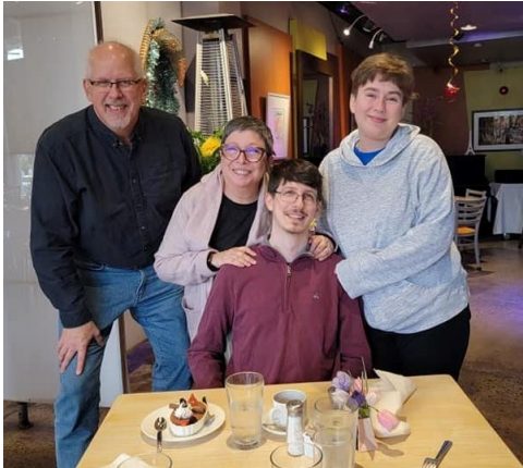
Mother's Day at Café Montmartre

Be sure to visit our family website at https://scherzinger.org where you can read all our past newsletters and see a lot more photos.