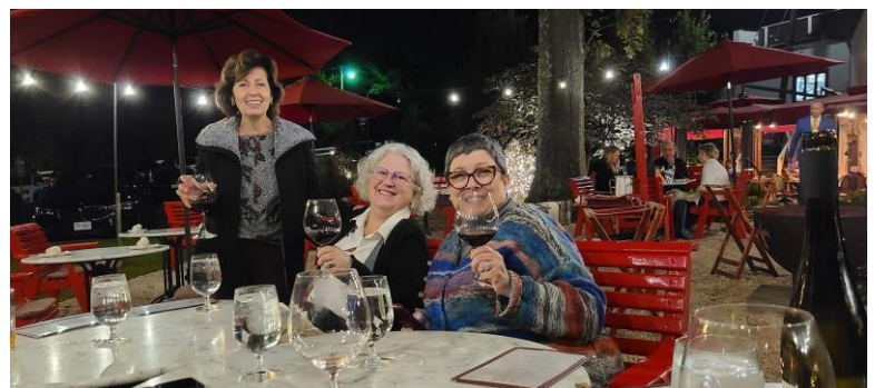
Birthday Girls at LAuberge Chez Francois Brasserie