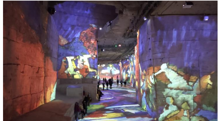
Carrières de Lumières Art Show