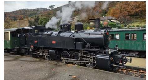
Train de l'Ardèche, Tournon, France