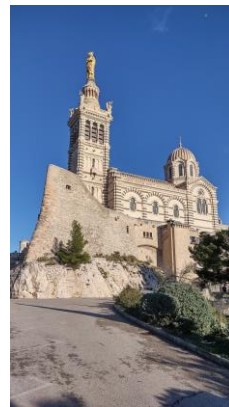
Notre-Dame de la Garde Marseilles, France