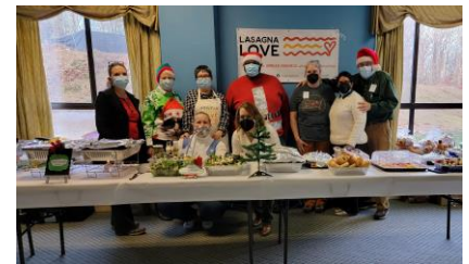
Lasagna Love Retirement Community Outreach