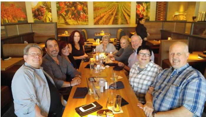
Family time in Florida