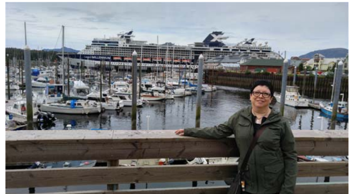
The Celebrity Millennium in Ketchikan, Alaska