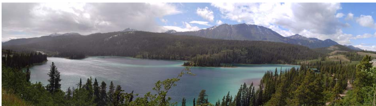
Emerald Lake, Yukon, Canada